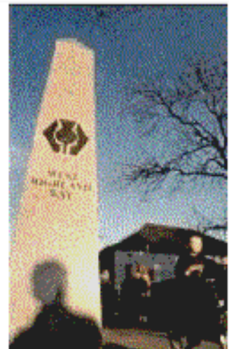
The West Highland Way Obelisk - Douglas Street, Milngavie